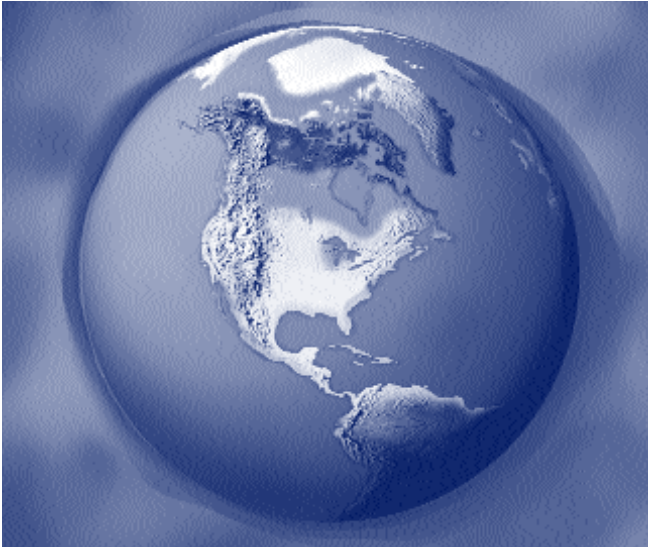
The world of “green” floorcovering is evolving. As global industry guidelines and standards become more defined, count on StarNet to help you separate fact from fiction.